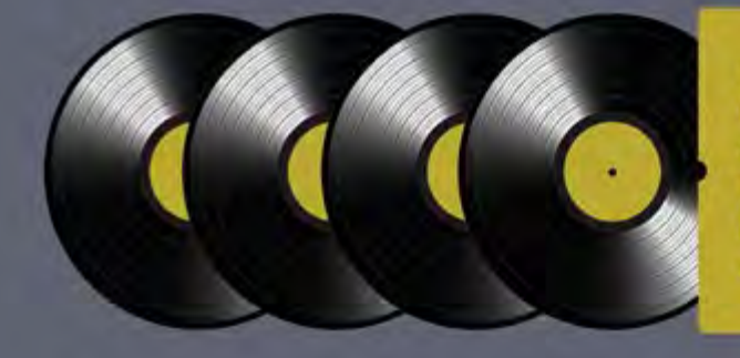
Record & CD Collections and Audio Equipment bought for cash

Bexhill's Original Collectors Vinyl Store