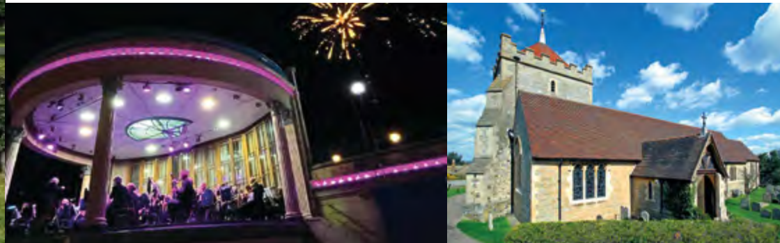
St Peter's Church