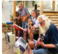
The Other Band