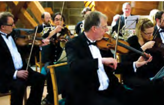
Bright Lights Theatre Company