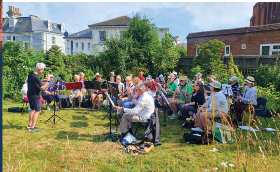
The Wacky Band

St Peter's Church, Church Street, Bexhill-on-Sea TN40 2HE Starts 6.00pm. Free admission.