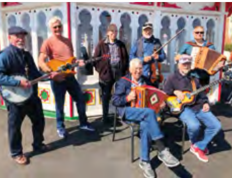
The Spinning Jenny Band

From 2pm - 6pm. Free event. Contact events@createmusic.org.uk for info.