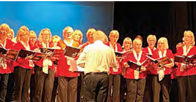
Schools Big Summer Sing