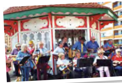
Battle u3a Ukulele Band