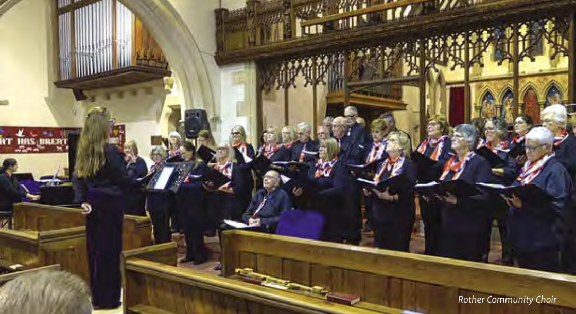
Rother Community Choir