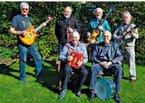
The Christchurch Singers