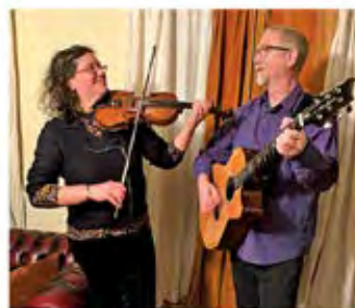
Holly and Swerve

7pm doors open for 7.30pm performance. Bar available. Tickets £10 on the door or via www.thegossamerthreadsproject.com .